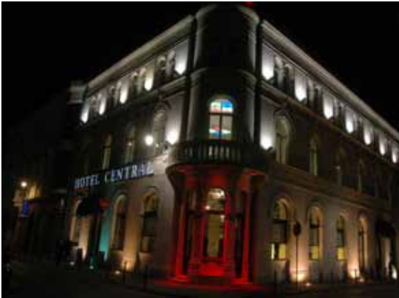
Hotel Central, Sarajevo Investor: Templeville Development, Ireland