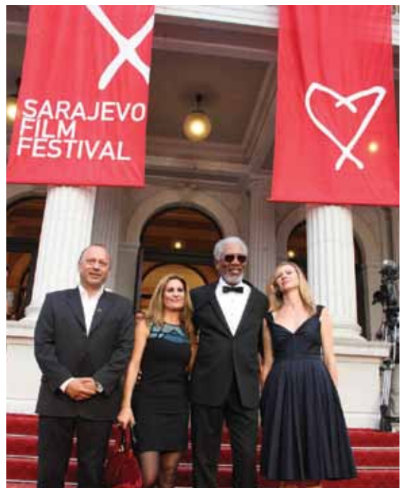
The Sarajevo Film Festival – the first and the largest film festival in the region!