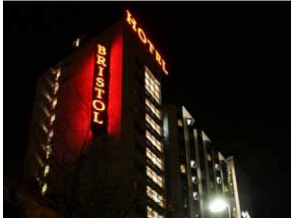
Bristol Hotel, Sarajevo Investor: Shiddi International, Saudi Arabia