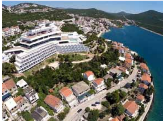
Hotel Grand, Neum Investor: B.M.V. Inženjering, Croatia