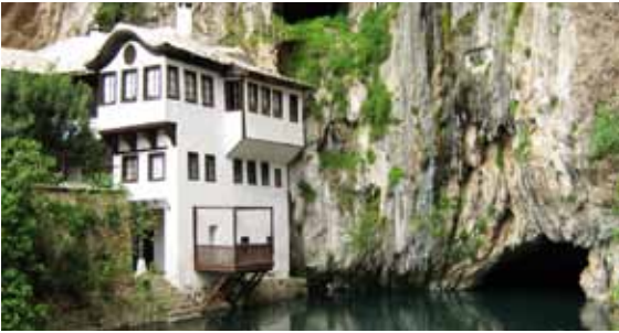
TEKIJA (Dervish monastery) at BLAGAJ, 16th-century