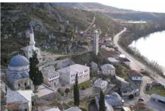
The historic urban site of Počitelj