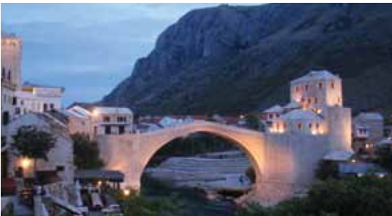
Old Bridge, Mostar UNESCO's World Heritage