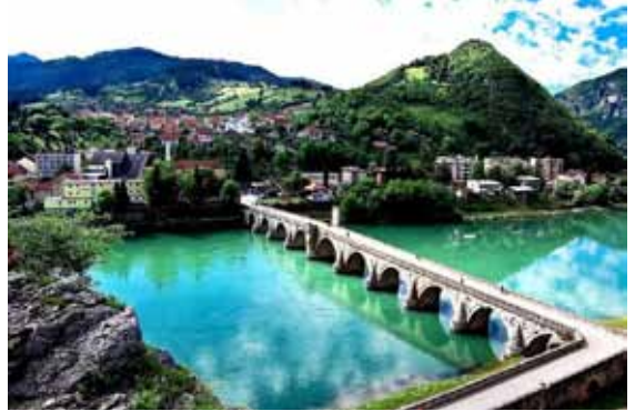
Mehmed Paša Sokolović Bridge in Višegrad