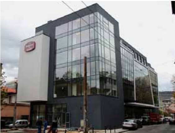
Residence Inn by Marriott, Sarajevo Investor: South European Investment Company, Saudi Arabia, UAE, Bahrain