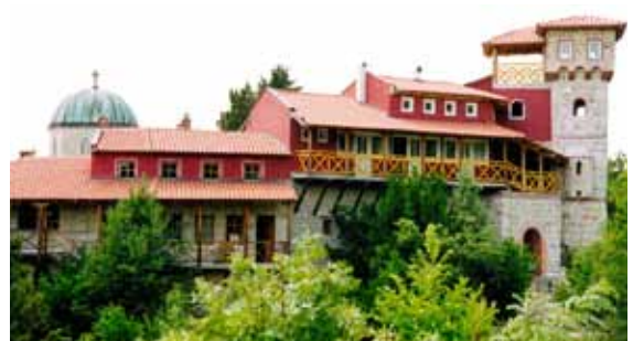
TVRDOS, Orthodox monastery near the city of Trebinje, 15th-century