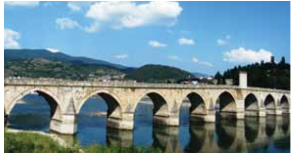
Mehmed Pasa Sokolovic Bridge, Visegrad UNESCO's World Heritage